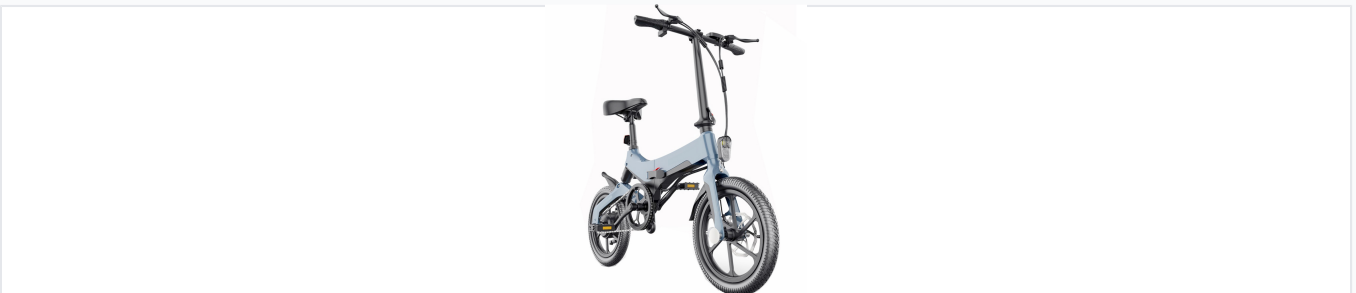
Designed for portability and efficiency in urban environments.