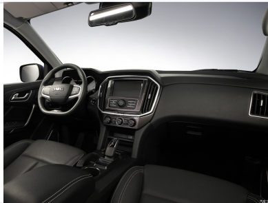
Sedan-inspired interior with Lear premium leather seating.