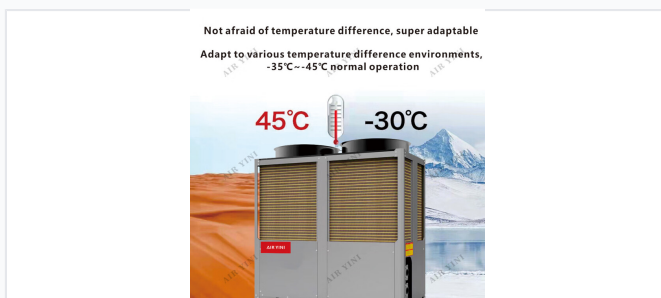
Designed for reliable operation across extreme temperature variances.