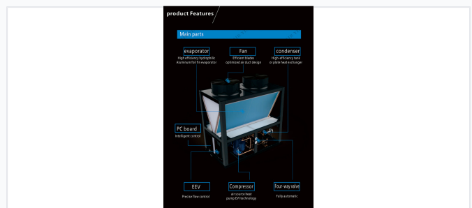
High-quality internal components featuring EVI compressor and efficient heat exchangers.