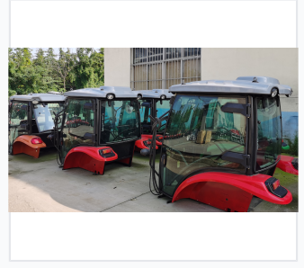
Weather-resistant enclosure suitable for harsh agricultural environments.