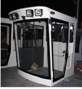
Robust frame construction designed for maximum durability and operator visibility.