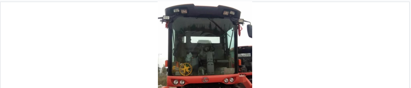
Standard cabin configuration with essential mounting points for agricultural equipment.