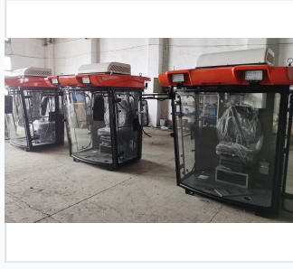
Ergonomically designed interior space to reduce operator fatigue.