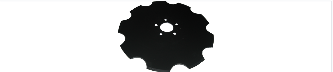
High-quality scalloped edge design optimized for efficient soil penetration and residue management.