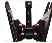
Adjustment knob locks tilt setting in place and allows continuous adjustment

This ceiling mount is designed for securely mounting flat panel displays with adjustable height and tilt. Constructed from high gauge cold rolled steel, it ensures stability and includes a universal hardware pack.