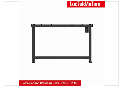
Loctekmotion Standing Desk Frame ET118E

This adjustable height desk frame allows users to create an ergonomic workspace. It features a single-motor lift system for seamless transitions between sitting and standing.