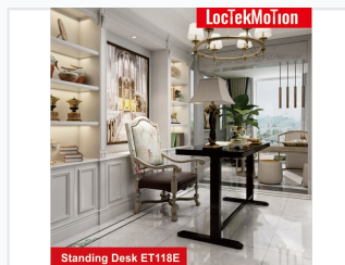
Standing Desk ET118E