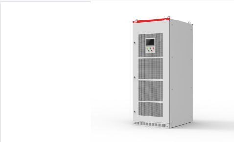
A compact 50A/75A modular AHF unit designed for rack or wall mounting.