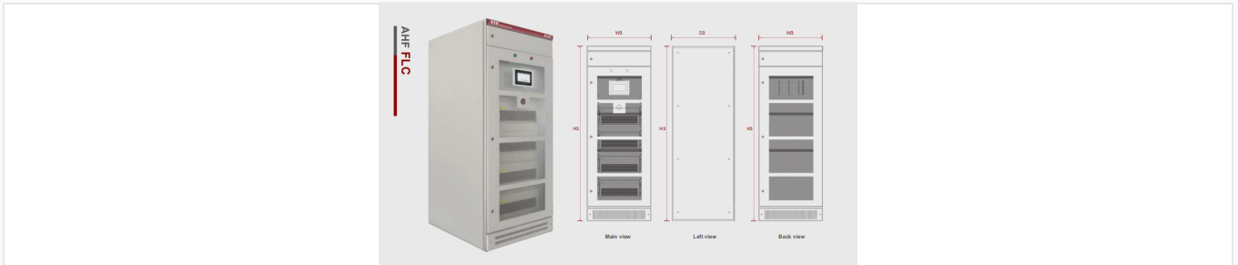
Dimensional layout for large-scale FCL cabinet configurations.