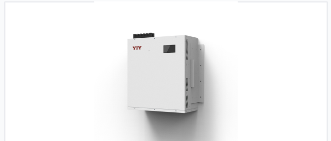
Integrated energy management system for industrial harmonic mitigation.