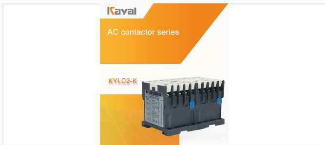
Compact design and technical parameters for the AC contactor series.