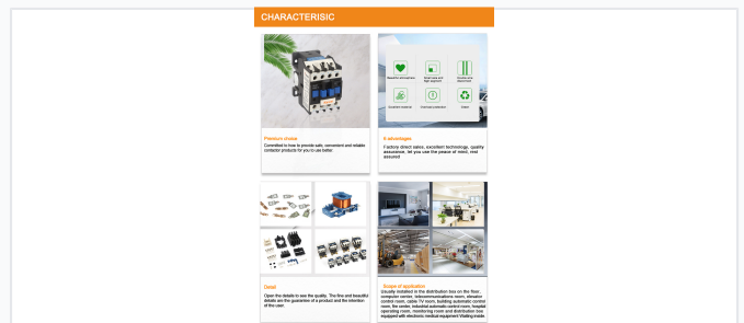
Designed for versatile industrial applications including control rooms and distribution boxes.