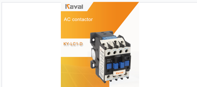
Standard LC1-D AC Contactor unit featuring clear terminal labeling for easy installation.