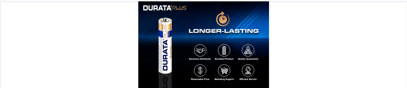
Extra heavy-duty AAA battery designed for reliable, long-lasting power.