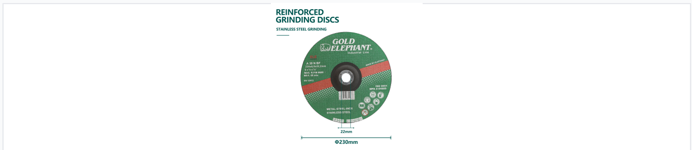
Technical specifications and reinforced structure details for the 9-inch grinding disc.