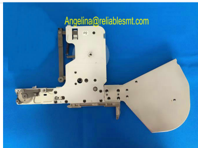
High-speed SMT paper feeder designed for consistent component delivery.