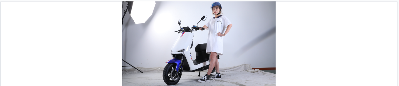
Designed for convenient urban transportation and daily commuting.