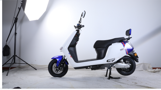
Equipped with wide-angle LED headlamps for safe driving.