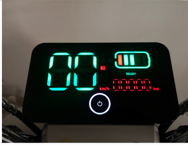
HD Dashboard providing real-time vehicle monitoring and feedback.