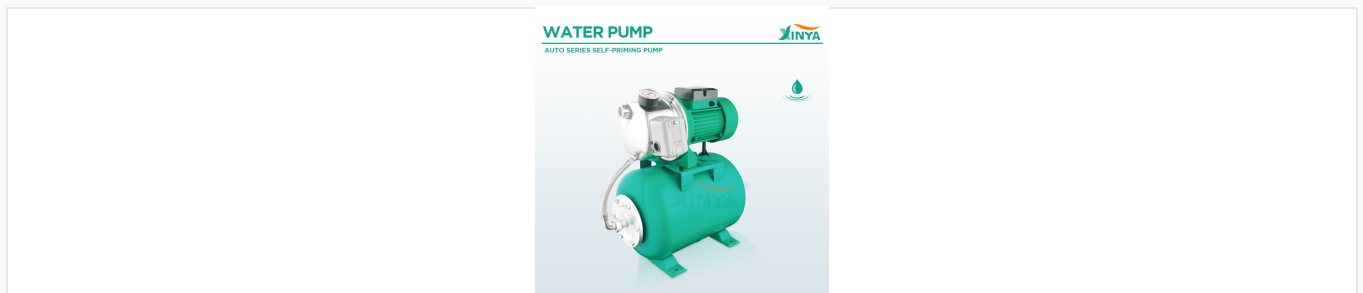
Integrated automatic booster system including membrane tank and pressure gauge.