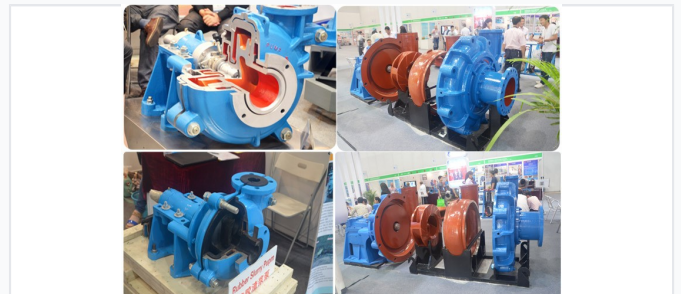
Heavy-duty rubber-lined configuration designed for corrosive and abrasive slurry handling.