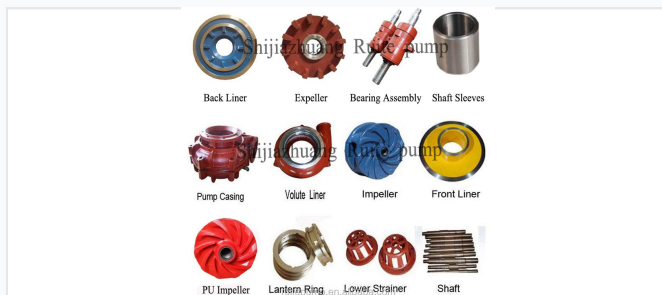
Comprehensive range of wear-resistant spare parts including impellers, liners, and bearing assemblies.