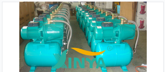
Compact and robust pump design suitable for residential and light commercial water distribution.