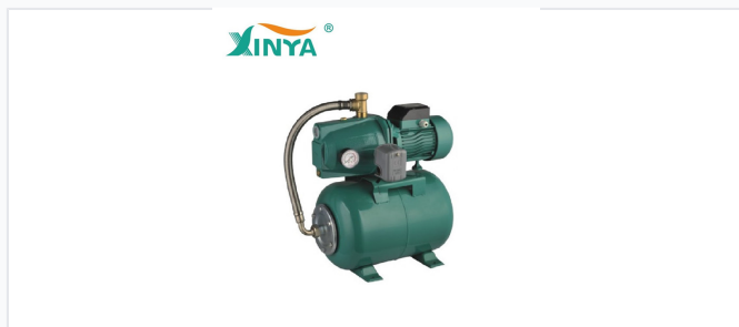
Fully integrated 750W automatic water booster system featuring a pressure tank and switch.