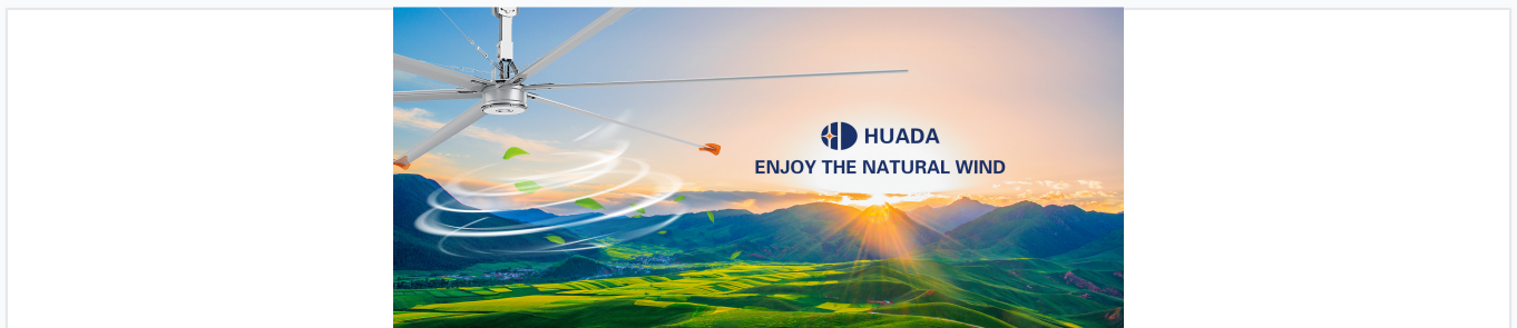
The 7.3m diameter fan provides massive air volume for large-scale industrial ventilation.