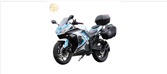
Sporty design with aerodynamic fairings and colorful LCD display.