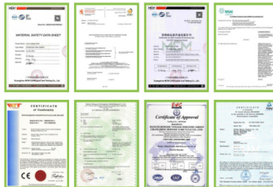
CE Certificate EEC Certificate EN Certificate TUV Certificate

Our products meet international safety and quality standards including EEC, CE, and DOT.