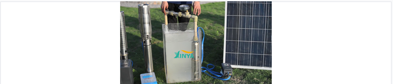
Illustration of the submersible solar pump operational setup.