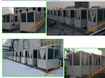
SUNCHI energy heat pump install case :

Example of a large-scale commercial installation utilizing multiple modular heat pump units.