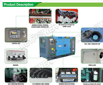
Detailed view of the internal electrical system, including German terminal blocks and anti-vibration mountings.