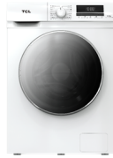
Front load washing machine 062 Series

Feature: BLDC smart inverter motor Touch LED display Memory of power Key thermal sterilization Overheating control Smart unbalance protection Add garment Blue light sterilization Honeycomb crystal drum Child lock