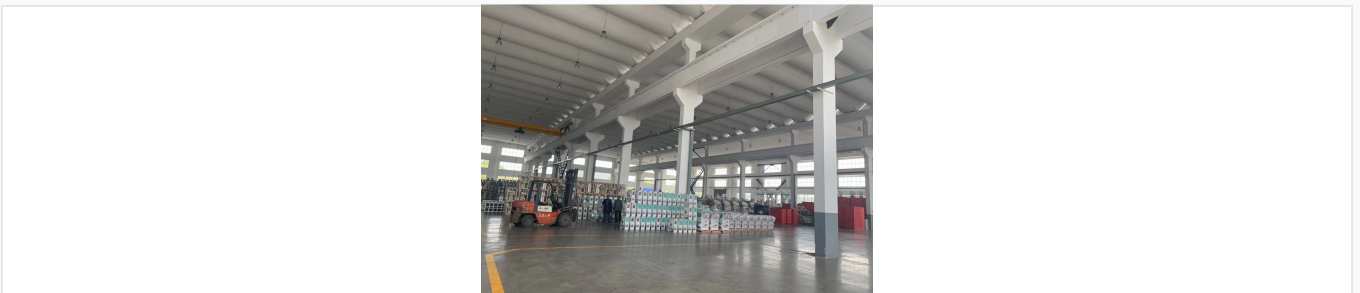
A robust agricultural machine designed for efficient threshing, peeling, and hulling of rice grains.