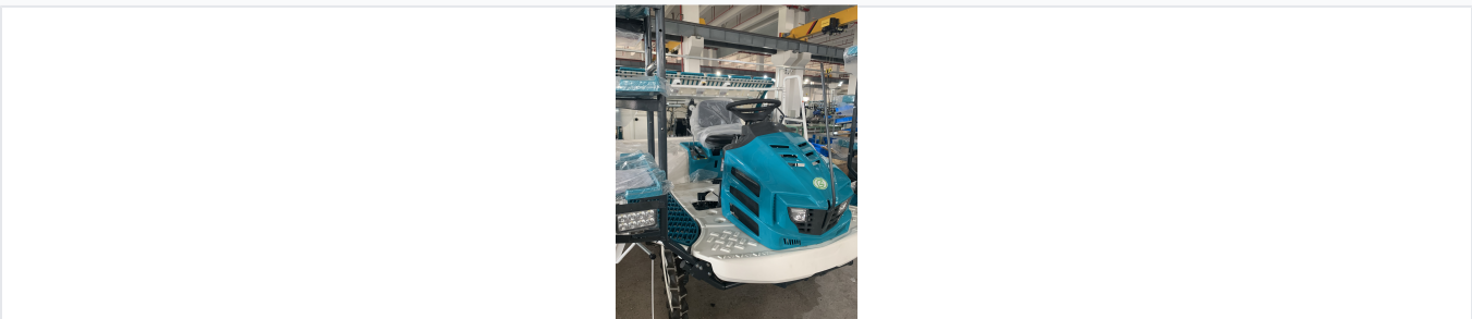
The 6-row riding-type transplanter maximizes productivity in large-scale paddy fields.