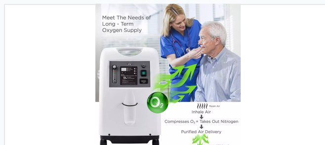
Illustration of the pressure swing adsorption process for high-purity oxygen delivery.

Technical overview of the unit's performance, dimensions, and compressor specifications.