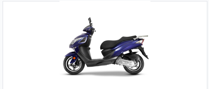
Sleek, aerodynamic body design optimized for urban commuting.