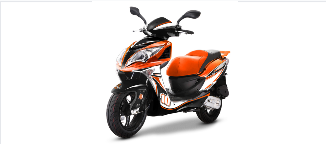
Modern aerodynamic styling with sharp, sporty lines.