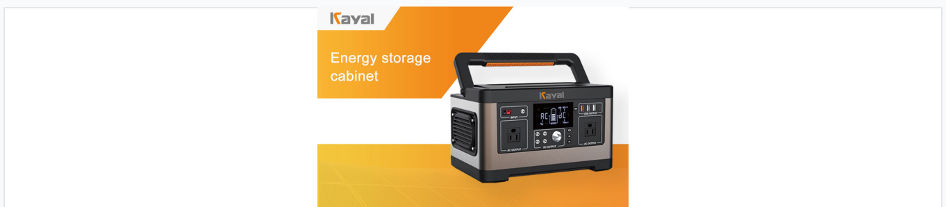
Portable energy storage cabinet with multiple output ports and integrated status display.