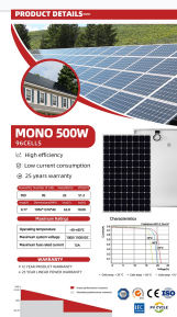
Performance characteristics and electrical data overview.