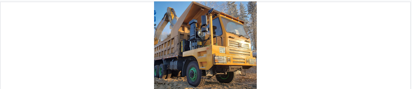
Robust construction built for demanding mining environments.