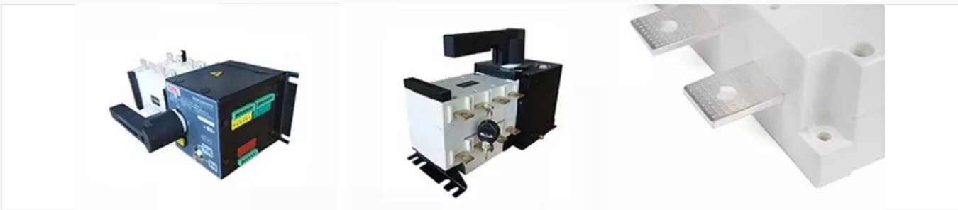
The 4-pole configuration ensures reliable switching of three phases and the neutral conductor.