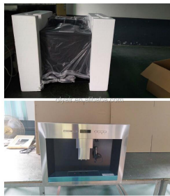
High-end, mark-free stainless steel exterior design.