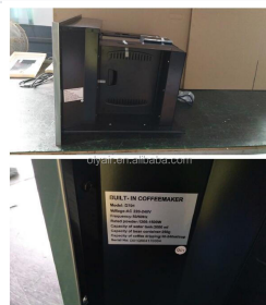
Detailed technical specifications label.