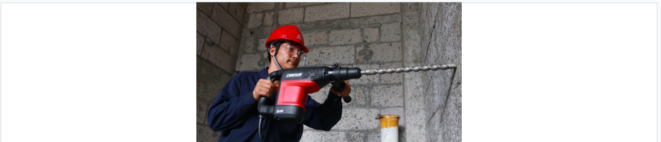
Industrial-grade rotary hammer designed for heavy-duty concrete and masonry work.