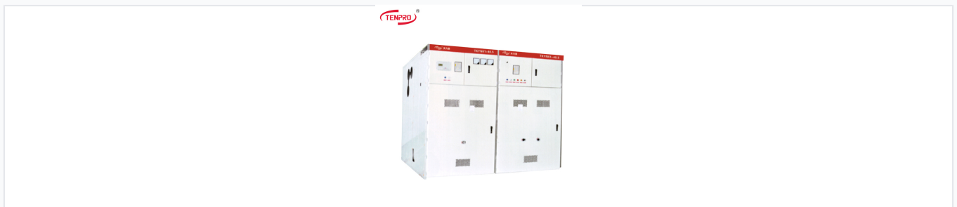
A detailed view of the metal-clad withdrawable switchgear unit.