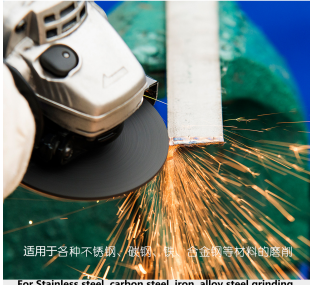
适用于各种不锈钢、碳钢、铁、合金钢等材料的磨削 For Stainless steel, carbon steel, iron, alloy steel grinding

Designed for effective grinding on stainless steel, carbon steel, iron, and alloy steel.