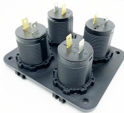
Compact design suitable for vehicle console installation.