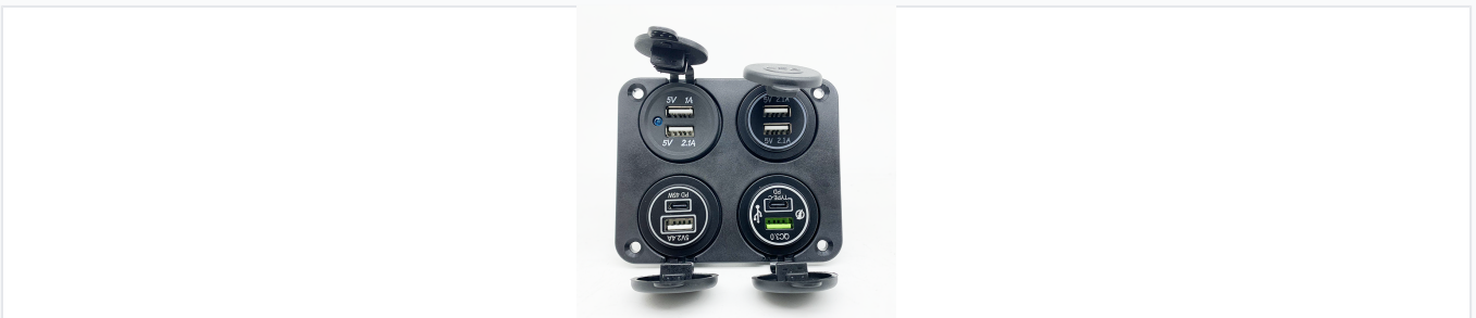
Panel layout and port configuration details.