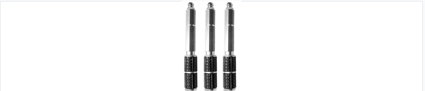
High-quality 3/8 inch injection packer designed for reliable concrete repair.