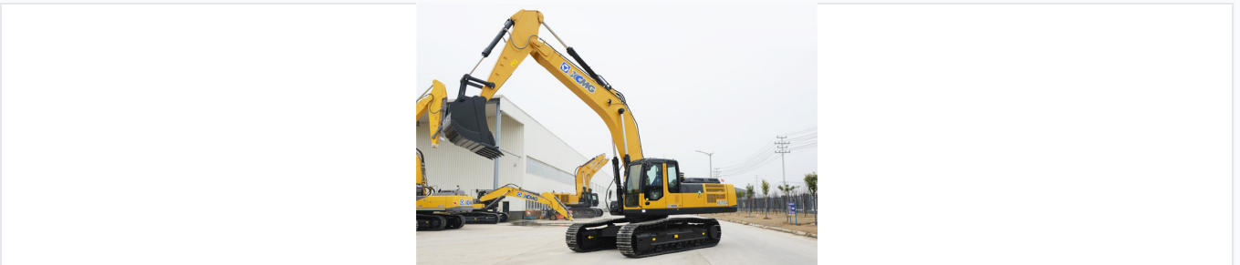
A 37-ton crawler excavator built for heavy-duty coal mining and excavation.