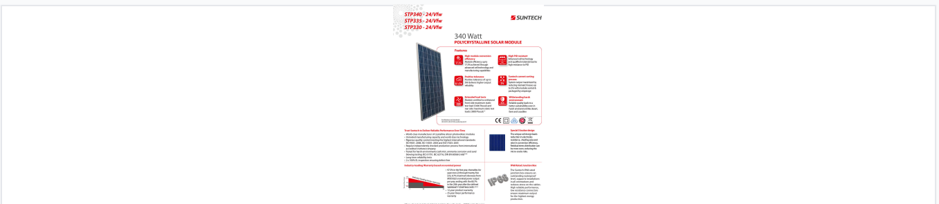
Diagram showing the technical composition and busbar design of the solar module.