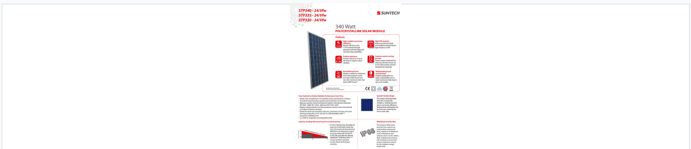
Key features including busbar design and performance metrics.