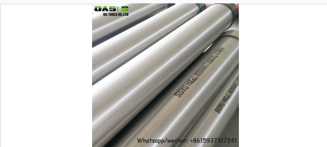
Multiple units of 10-inch diameter seamless tubing ready for deployment.