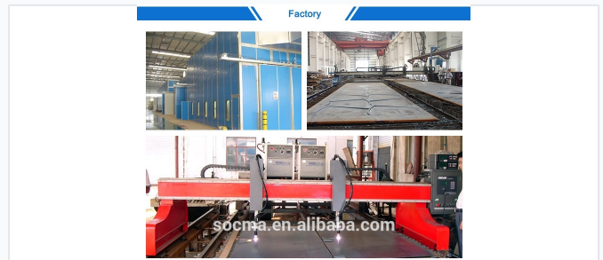
Ideal for logistics, ports, and heavy manufacturing environments.