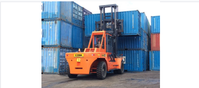
A robust 30-ton diesel forklift designed for high-capacity industrial lifting.