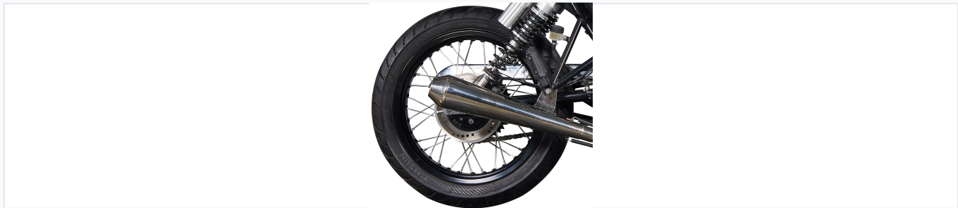
Robust rear suspension with coil-over shocks and high-performance exhaust.