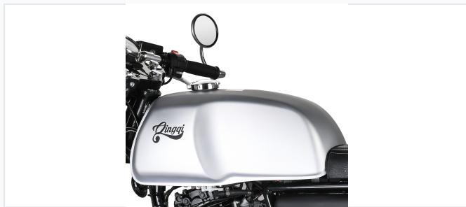
Refined retro aesthetics with high-quality seating.