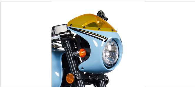
Classic café racer design with aerodynamic front fairing.