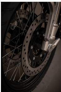
High-performance braking system with drilled rotors.