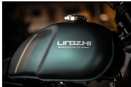
Classic cafe-racer inspired fuel tank design.