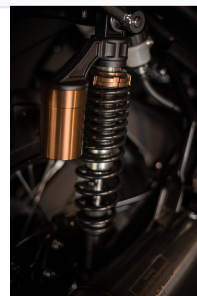
Adjustable coil-over shock absorber for optimized ride control.