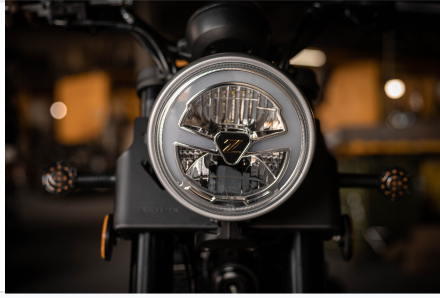
Modern LED lighting for improved visibility.