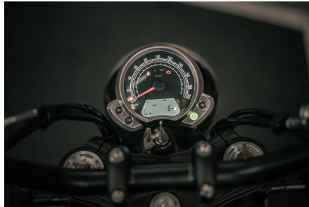
Clear analog dashboard with essential riding metrics.