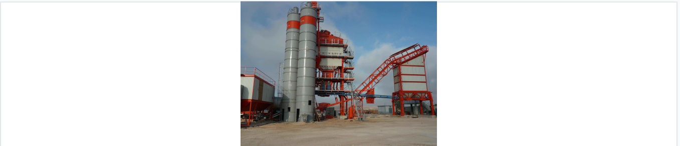
A high-capacity stationary asphalt production facility featuring a robust modular design.