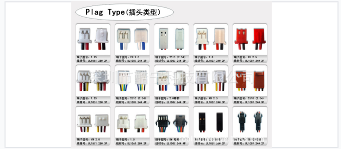
Various terminal connectors available to suit different PCB and power interfaces.