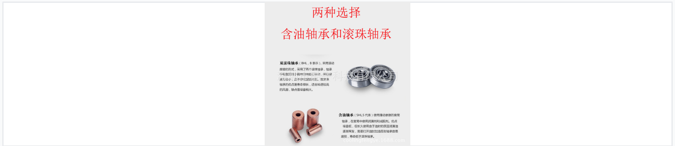
Comparison between high-durability ball bearings and low-noise sleeve bearings.