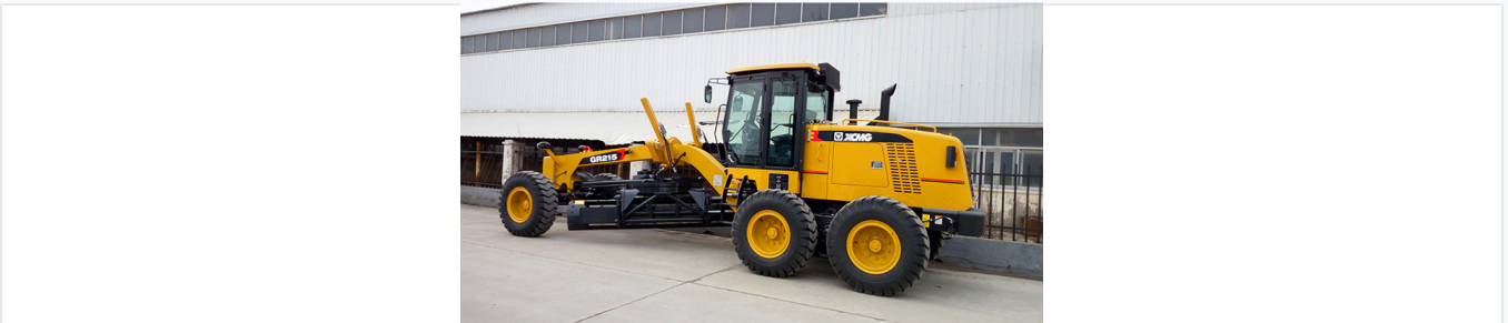
Heavy-duty 215 HP motor grader designed for road maintenance and leveling.