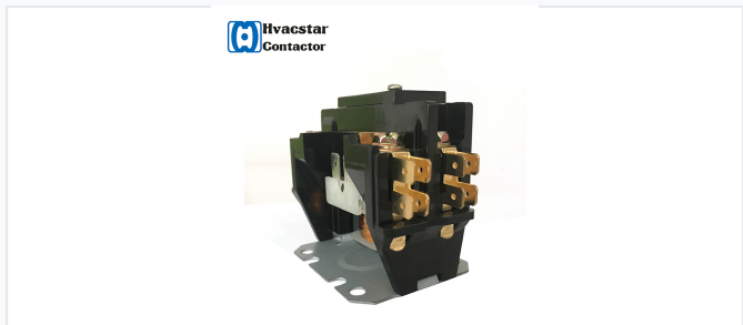
Compact design suitable for various HVAC&R systems.