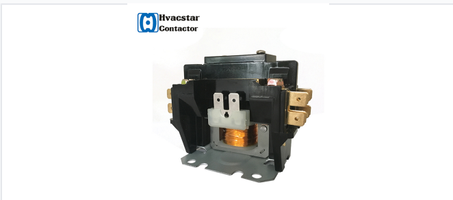
Electronic AC contactor designed for HVAC and refrigeration control.