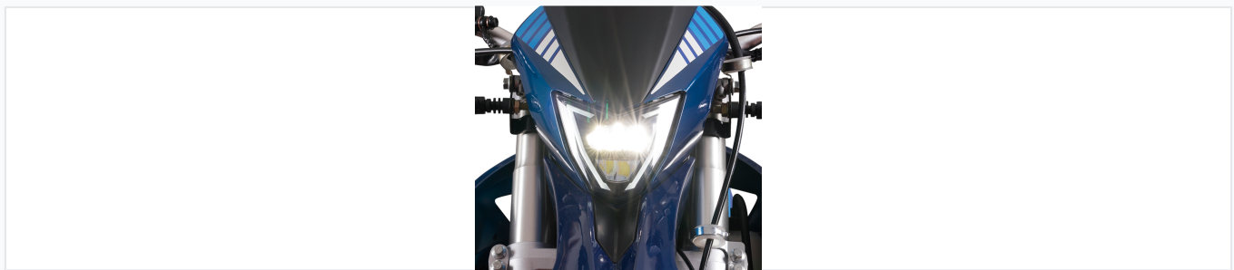
Rugged design optimized for off-road performance.